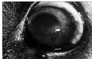
Chronic corneal pigmentation in a controlled case of pannus.

Check us out at www.eyecareforanimals.com