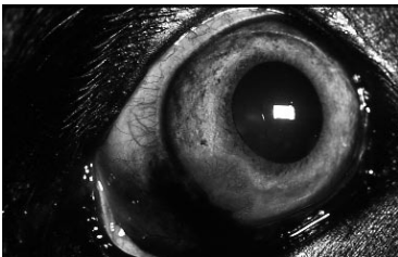
Early pannus, note temporal corneal neovascularization.

Treatment with topical steroids alone has been the mainstay of treatment for many years, but the addition of topical cyclosporine can improve control of the condition. Subconjunctival steroids can also be of benefit in controlling more severe cases. Cases that are not responsive to medical therapy may necessitate superficial keratectomy or treatment with beta radiation. Always inform owners that this disease will require lifelong treatment, and suggest consultation with an ophthalmologist in severe cases or in cases that are poorly responsive to medical therapy.