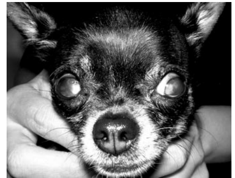
Cicatricial Ectropion caused by an overzealous upper eyelid entropion surgery leading to an inability of the dog to blink. She cannot distribute her tear film. STT was normal.

Macropalpebral fissure, euryblepharon, or overly large eyelid openings are conditions that can lead to lagophthalmos. This can be associated with a sometimes imperceptible, incomplete closure of the